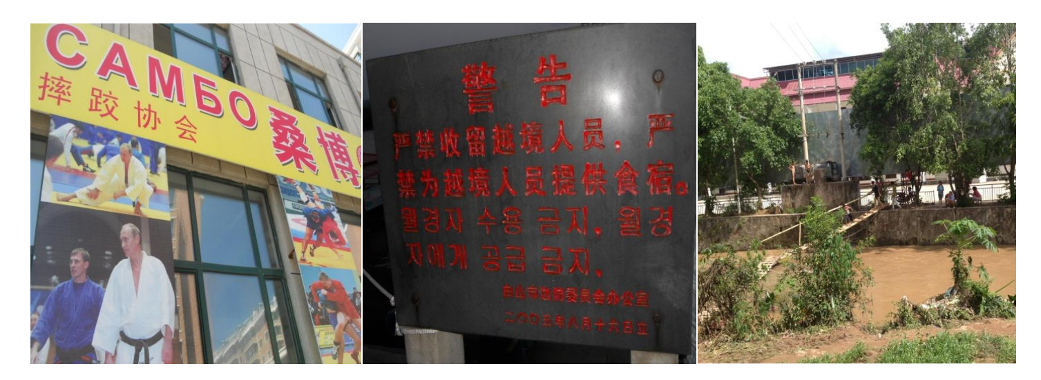
ABOVE, FROM L TO R: Sambo's number one ambassador adorns a dojo in Suifenhe, Heilongjiang. A sign in Linjiang, Jilin, warns against providing food and shelter to illegal Yalu River crossers. Half a mile downstream from the official Sino-Burmese border post at Wanding, Yunnnan, a bamboo bridge offers youth recreation and expedited, undocumented crossing for all.

ABSTRACT: Despite loudly spoken, nationalist assertions not to cede "an inch of Chinese territory," the PRC's practices on its many, lengthy borders show a great deal of flexibility and innovation. Use of foreign currency, soft and unregulated external borders supported by hard internal ones, gambling havens, and the entire concept of "autonomous minority regions" are not merely concessions to a reality of unenforceable laws. These non-standard policies and institutions advance China's national interests and often acknowledge the difficulties of developing country migrants. Not only territory but people are central to the PRC's (re-)establishment and defense of Chinese sovereignty, and when people cross international borders illegally, in large numbers, national sovereignty is at stake. Differences in border defense may strike legal scholars as weak rule of law, but they actually reflect differences in securitization, according to whether immigration, illicit trade, or any other threat is present and "securitized." Based on preliminary fieldwork on the Chinese borders with North Korea and Burma¹ in 2013 and Russia in 2014, this study finds that the PRC has pioneered bilateral currency policies, selective regulation of international migration and illicit trade, and relations with unrecognized, reprimanded, and "rogue" regimes, including non-state-sponsored economic colonization.