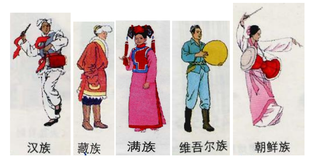
(FROM L TO R): Han (over 90% of the population and more or less synonymous with "Chinese" as an ethnic term), Tibetan, Manchu, Uyghur, Korean