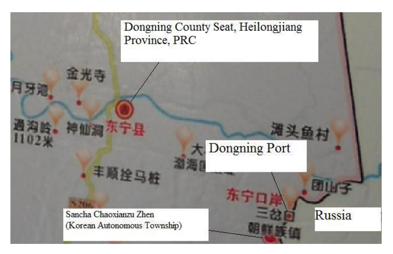
FIGURE 1: Southeastern Heilongjiang, from the Dongning County map posted at the Dongning bus station.

In the opaque context of Sino-North Korean relations, Chairman Xi Jinping's decision to visit South Korea before the North has been widely viewed as a sign that the PRC is "annoyed" by the DPRK. 4 Writing for The Diplomat , Robert Potter suggests that North Korea, for its part, doesn't want to become economically dependent on China. Bilateral relations between these countries are one of today's most vital mysteries, as they are perhaps the only hope for denuclearization of the Korean peninsula. More than communist brotherhood, the two states maintain an uneasy alliance because the North provides a buffer against U.S. military presence in South Korea, and the long-predicted collapse of the regime could potentially send millions of refugees pouring into Manchuria. This has been a constant in miniature for the past two decades, and China has consistently repatriated North Koreans on the grounds